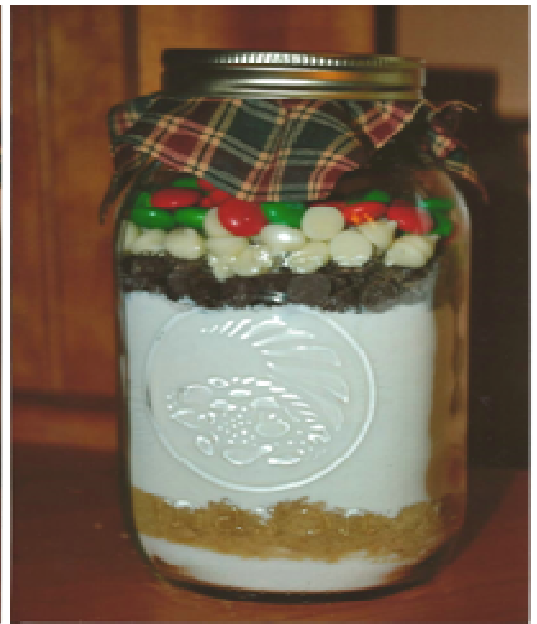
M& M Cookies

Interfaith Hospitality Network (IHN) has learned that another non-profit organization, Giving Every Season , an affiliate of Trade Palms , plans to add IHN to its mission, in addition to continuing to support the Dayton Children's Medical Center. In August Giving Every Season will begin manufacturing Cookie Jars for sale during the Thanksgiving and Christmas Holidays. Each one-quart mason jar contains all the dry ingredients needed to make a batch of cookies. Churches are invited to help us in this effort. All the ingredients and materials will be provided. Proceeds of the sale will go to both IHN and the Dayton Children's Medical Center.